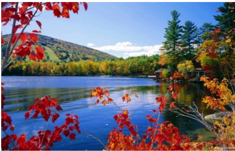
Figure 4: Scene illustrating heterochromic contrast