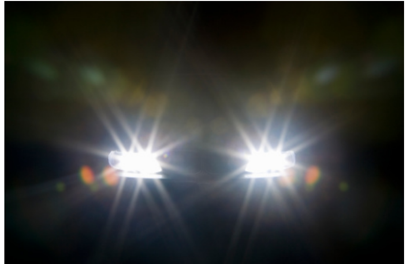
Figure 3: Example of starbursts seen with car headlights

increased sensation of glare and a perception of larger halos around central lights which severely diminished their capacity to detect peripheral lights surrounding the central source. 21 It was felt this deterioration in visual performance could cause trouble in seeing pedestrians and road signs, thus representing a risk factor in traffic. Given the links with light scatter and glare, it is again reasonable to think that the perception of starbursts and haloes could be reduced with the use of spectral filters.